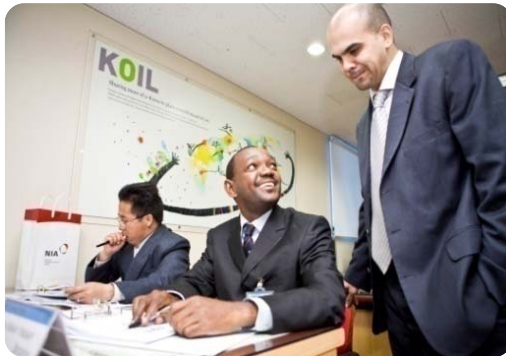
KoIL Program by Year (1998~2014)

This program shares ICT development experience while running seminar programs to develop informatization capabilities for policy makers, developers and government employees of developing countries